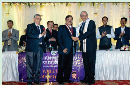
Change of Medallian