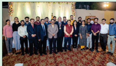
Group Photo of JDN MSN Members with IMA Office Bearers