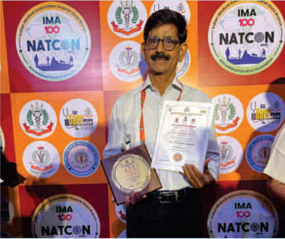
IMA Mumbai Branch received - IMA Publication Award for IMA News Bulletin