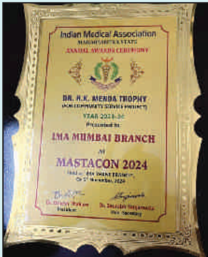
Dr. R. K. Menda Award for Community Service Project