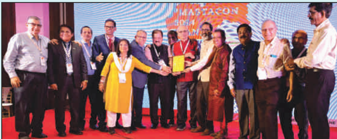
Receiving Dr. R. K. Menda Award for Community Service Project